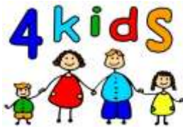
Treasure Hunt 7

I have 8 legs and some people don't like me :(