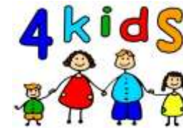
Treasure Hunt 7