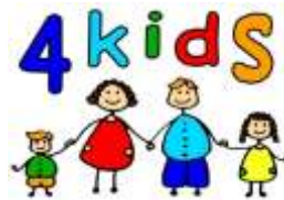
Treasure Hunt 7

Place this where you want to hunt to begin